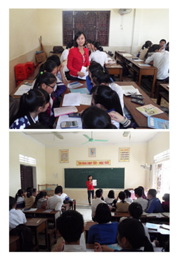
Figure 2. Assignment process in the class

The Assignment process in the class is described in Figure 2.