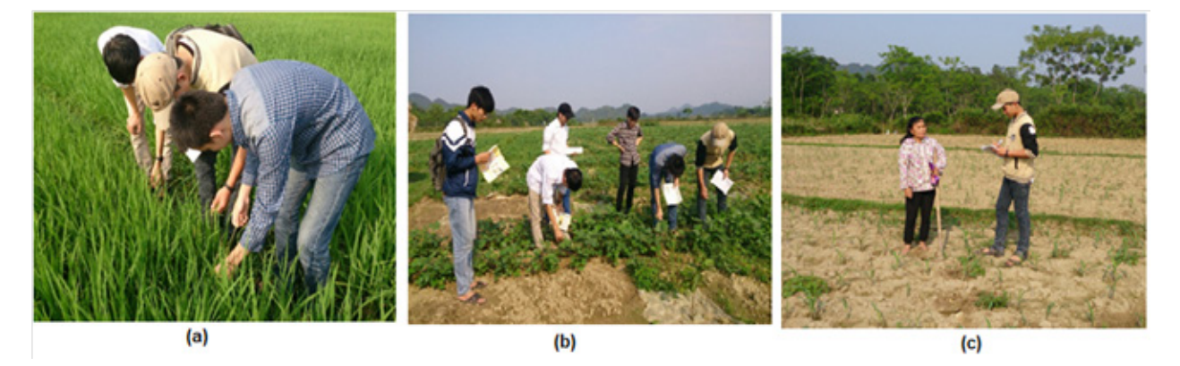
Figure 4. Students are conducting the field surveys

- Students design experiments to study the roles of fertilizers and provide solutions for the appropriate fertilization in a particular crop group with under-nutrition.