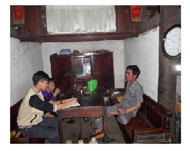
Figure 3. Students are taking surveys on the cultivating households

+ Field surveys in survey gardens to detect signs of deficiency or over-nutrition in plants on leaf, stem and branch organisms compared with normal leaves in the same plant species in the household area (Figure 4).