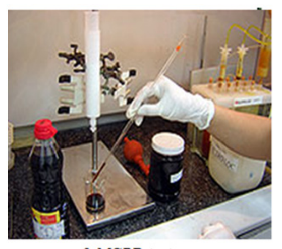
3-MCPD test contained in soy sauce

Answer is A: Dip the knife into the gasoline or oil. Example 12. In the market today, some soy sauce (soy sauce) has been banned because of the amount of 3-MCPD (3-monoclopropane-1,2-diol) exceeds the permitted standard. In the process of producing soy sauce, the manufacturer uses HCl to hydrolyze vegetable proteins to increase the saltiness and taste. In this process, there is a fatty acid hydrolysis that produces glixerol. HCl reacted with glixerol to produce a 2-isomer mixture of 3-MCPD. The 3TP-3's MCPD is