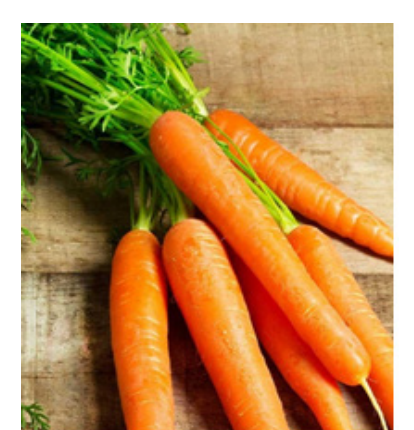
Carrots containing many natural carotene

Example 2. Carotene (orange-yellow pigment in carrot) C_{40}H_{56} contains double bonds and saturated rings in the molecule. Recognize that when fully hydrogenated carotene is obtained C_{40}H_{78} saturated hydrocarbons. The number of double bonds and number of rings in the carotene molecule respectively are A. 12; 2 B.13; 2 C.14; 3 D.13; 3