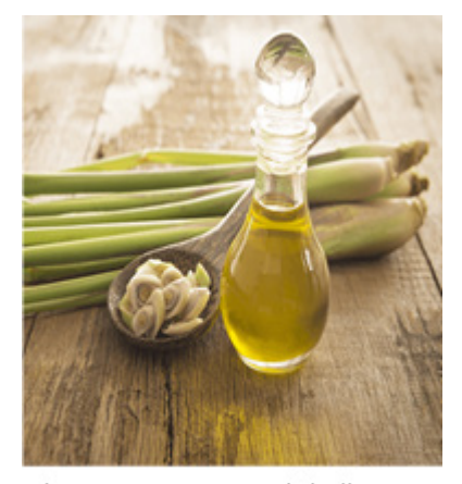
lemongrass essential oil