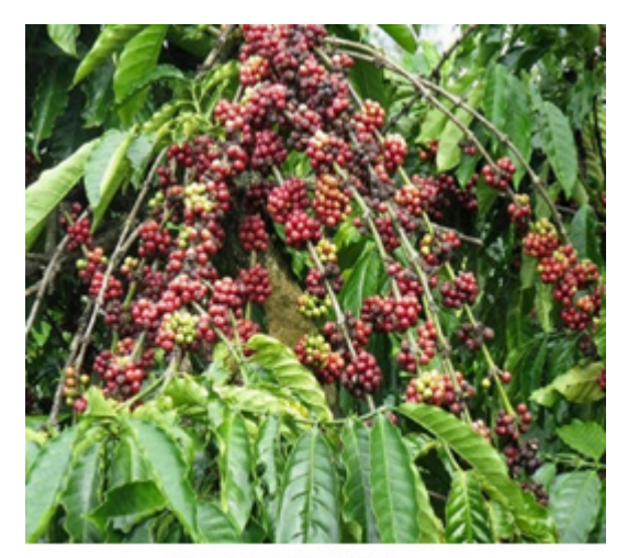
Coffee in Vietnam

A. NH<sub>3</sub> B. N<sub>2</sub> C. NaCN D. NO<sub>2</sub>