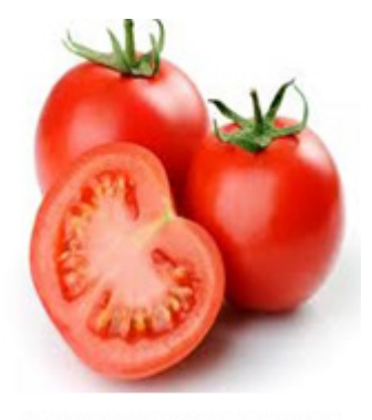
Tomatoes contain many natural lycopene