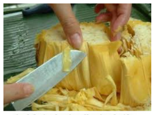
jackfruit plastic adhesive knife

Answer is A: Dip the knife into the gasoline or oil. Example 12. In the market today, some soy sauce (soy sauce) has been banned because of the amount of 3-MCPD (3-monoclopropane-1,2-diol) exceeds the permitted standard. In the process of producing soy sauce, the manufacturer uses HCl to hydrolyze vegetable proteins to increase the saltiness and taste. In this process, there is a fatty acid hydrolysis that produces glixerol. HCl reacted with glixerol to produce a 2-isomer mixture of 3-MCPD. The 3TP-3's MCPD is