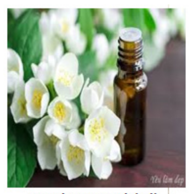
Jasmine essential oil