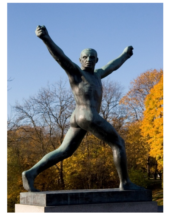
Figure 1. The Vigeland tetrahedral man (Gustav Vigeland, Man Running, before 1930)